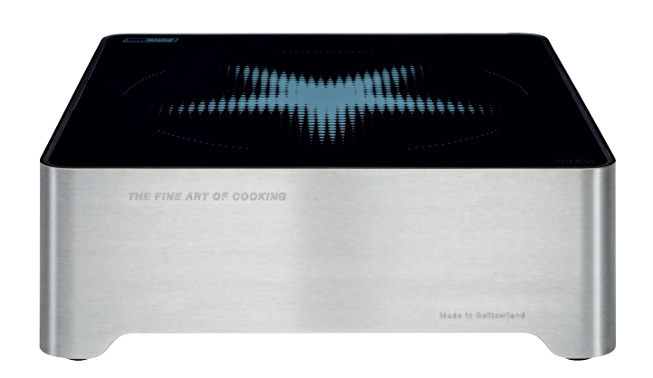
SINA - Quality at its best.

SINA is the perfect choice for effective visible cooking. SINA One, SINA Twin and SINA Wok are the only appliances in their class that feature an aesthetically designed back. They are elegant from every angle – and especially from the perspective of your guests – which makes them the ideal choice when cooking for an audience.